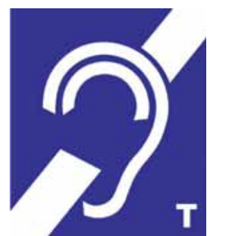
HEARING LOOP INSTALLED Switch hearing aid to T-coil

"Normal is the best word to describe how I felt that first time in church," she adds. "I felt normal for the first time and realized all that I had been missing." W